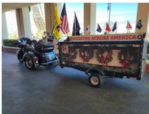
Each branch of service represented on the trailer