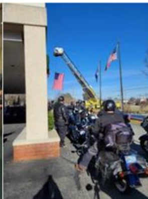
Lining up to leave