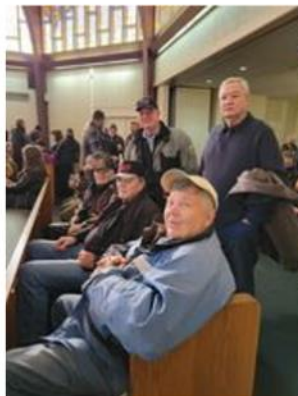
Breakfast & Safety Meeting

Chapter D in Richmond, VA participated in the recent Wreaths Across America event on Saturday, December 16. Over 250 motorcycles were escorted by law enforcement to the Veterans Cemetery in Amelia, VA. There are over 6000 graves of American soldiers buried there and all graves were festively adorned with the wreath's provided by people who donated to Wreaths Across America. Riders met at Woodys Funeral Home in Chesterfield, VA who provided some breakfast goodies and coffee for the riders and at 10 AM the riders were given a safety meeting before departing. The ceremony at the cemetery was such a moving experience and many groups including fraternal organizations, military organizations and other groups as well as individuals who wanted to participate.