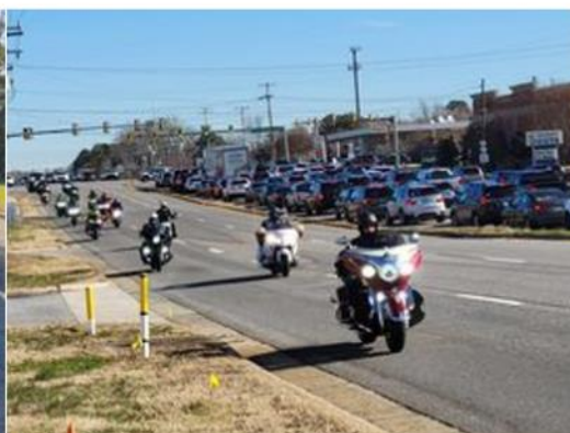
Headed to Amelia for Wreaths Across America