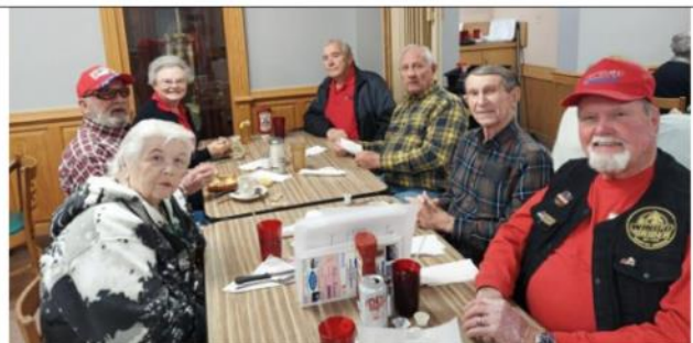
VA-K at Clarence's Restaurant