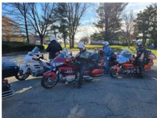
Our chapter members are ready to roll